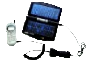
SolarPort™ Portable Power