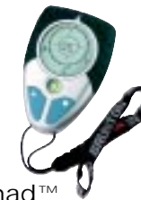
Nomad™ Digital Compass